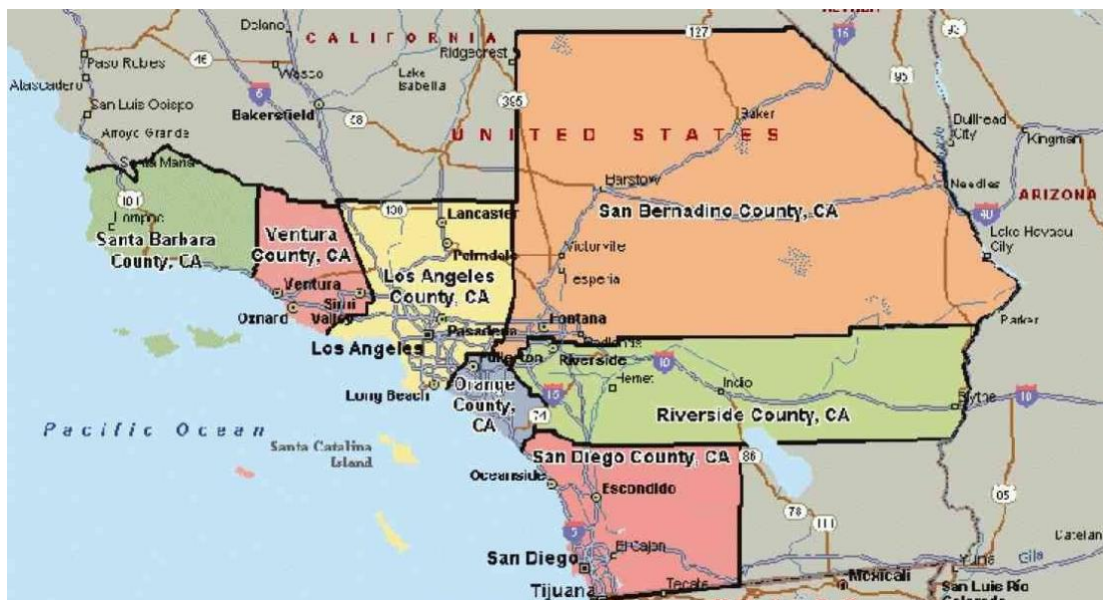
Figure 1. Southern California Counties

Table 1 provides 2007 pension fund membership information and population counts for the counties to give a sense of relative scale. In total, the fund was responsible for the retirement benefits almost