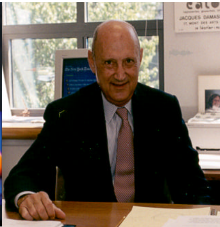
PROF. BURTON G. MALKIEL

Princeton University Author of A Random Walk Down Wall Street