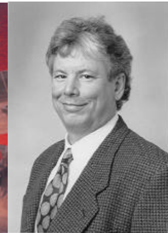
PROF. RICHARD H. THALER

University of Chicago Author of The Winner's Curse and Quasi-Rational Economics